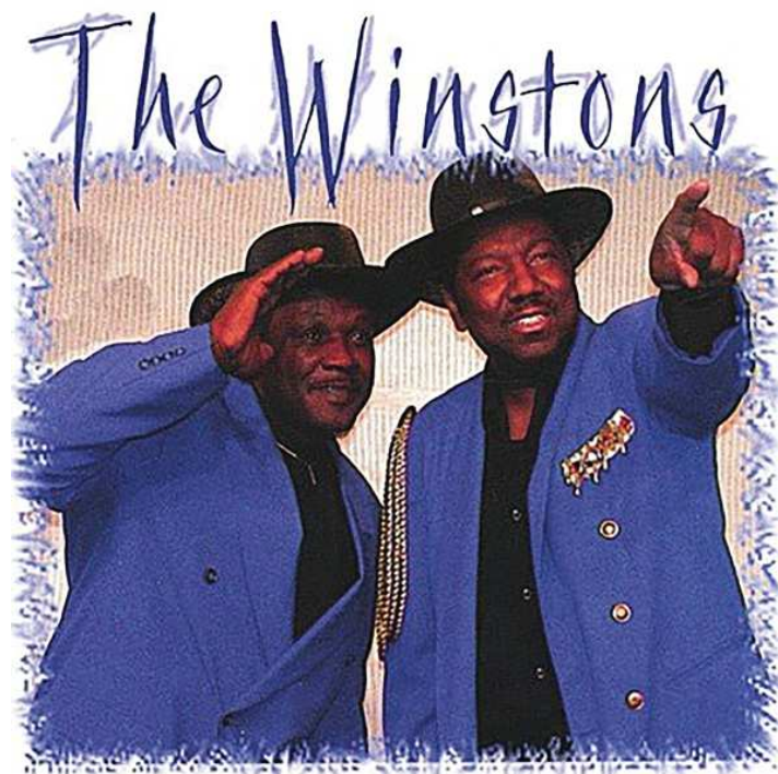
The Winstons 2002